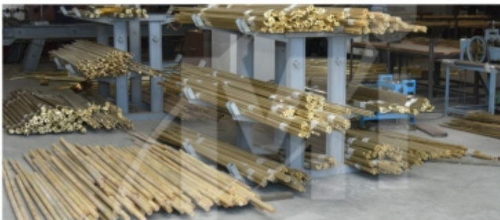
Brass Extrusion Rods