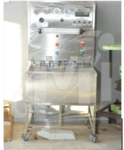
Pressure Checking Machine