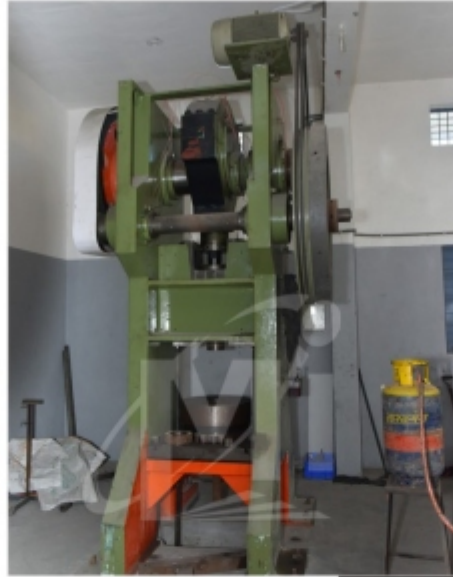
Hollow Forging Machine