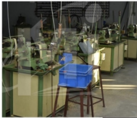
Hand Operated Machineries