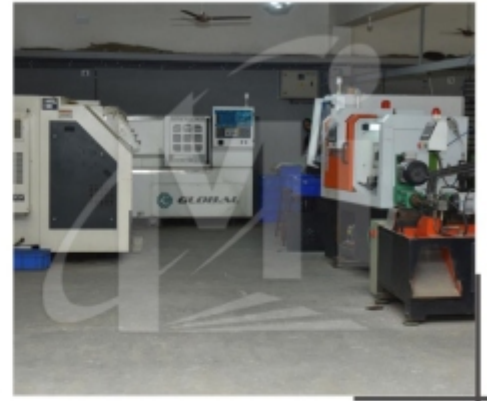
CNC TMC Machine